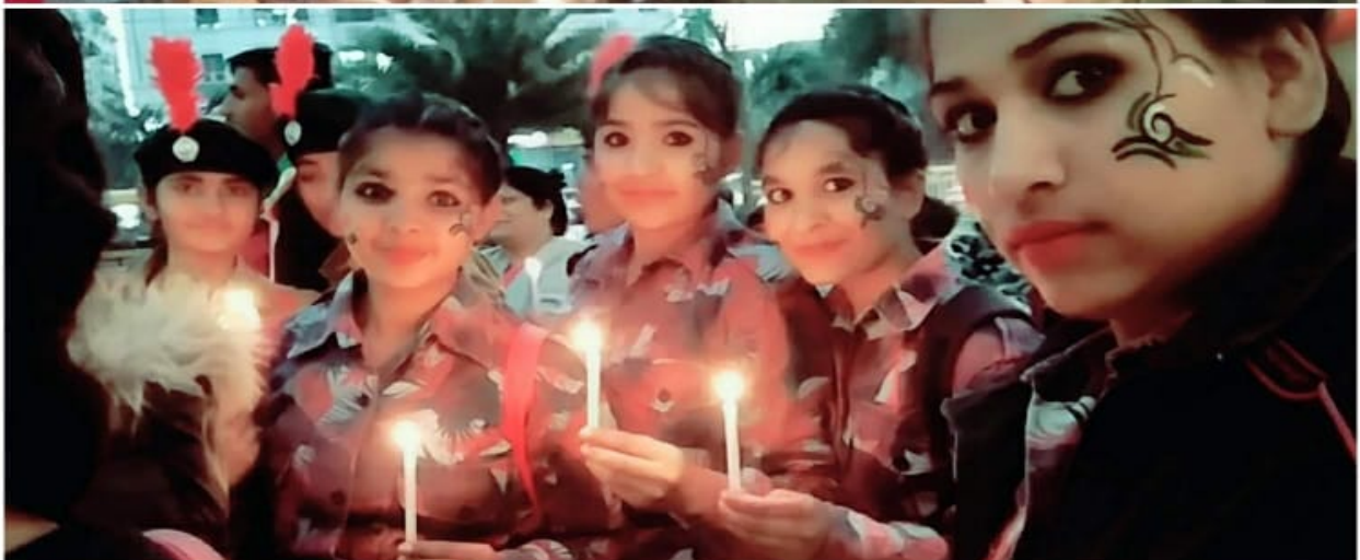
2018-19 #8 SHAHID PARIVAR SAMMAN C21 MALL 26 january 2019