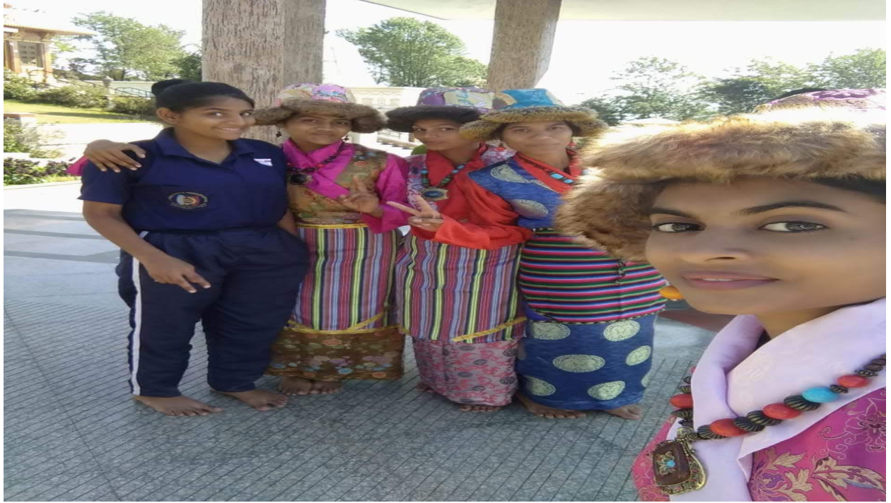
2018-19 #4 TREKKING SIKKIM 22-28 november 2018