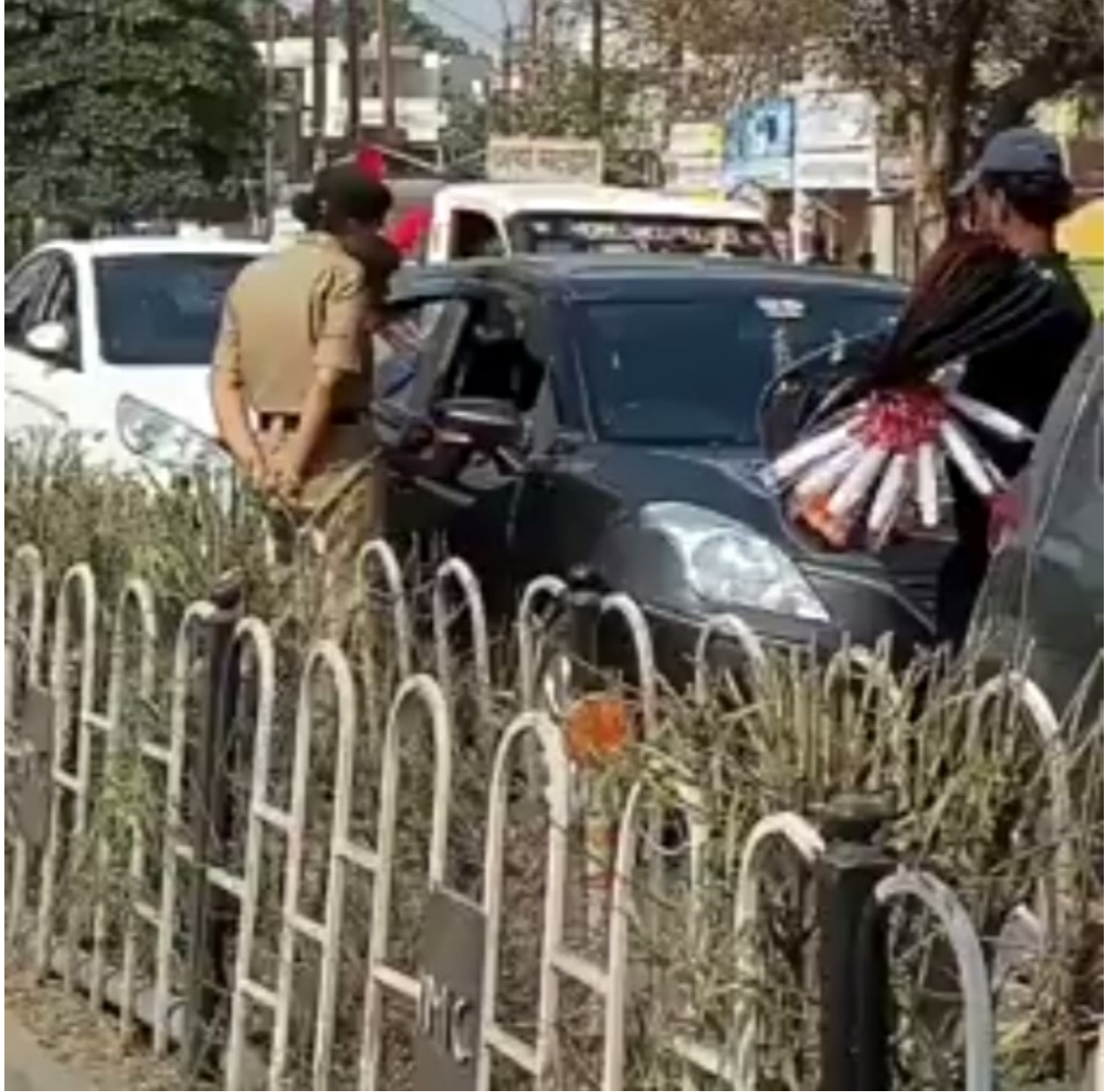
2018-19 #2 SWACHH PAKHWADA 2 October 2018