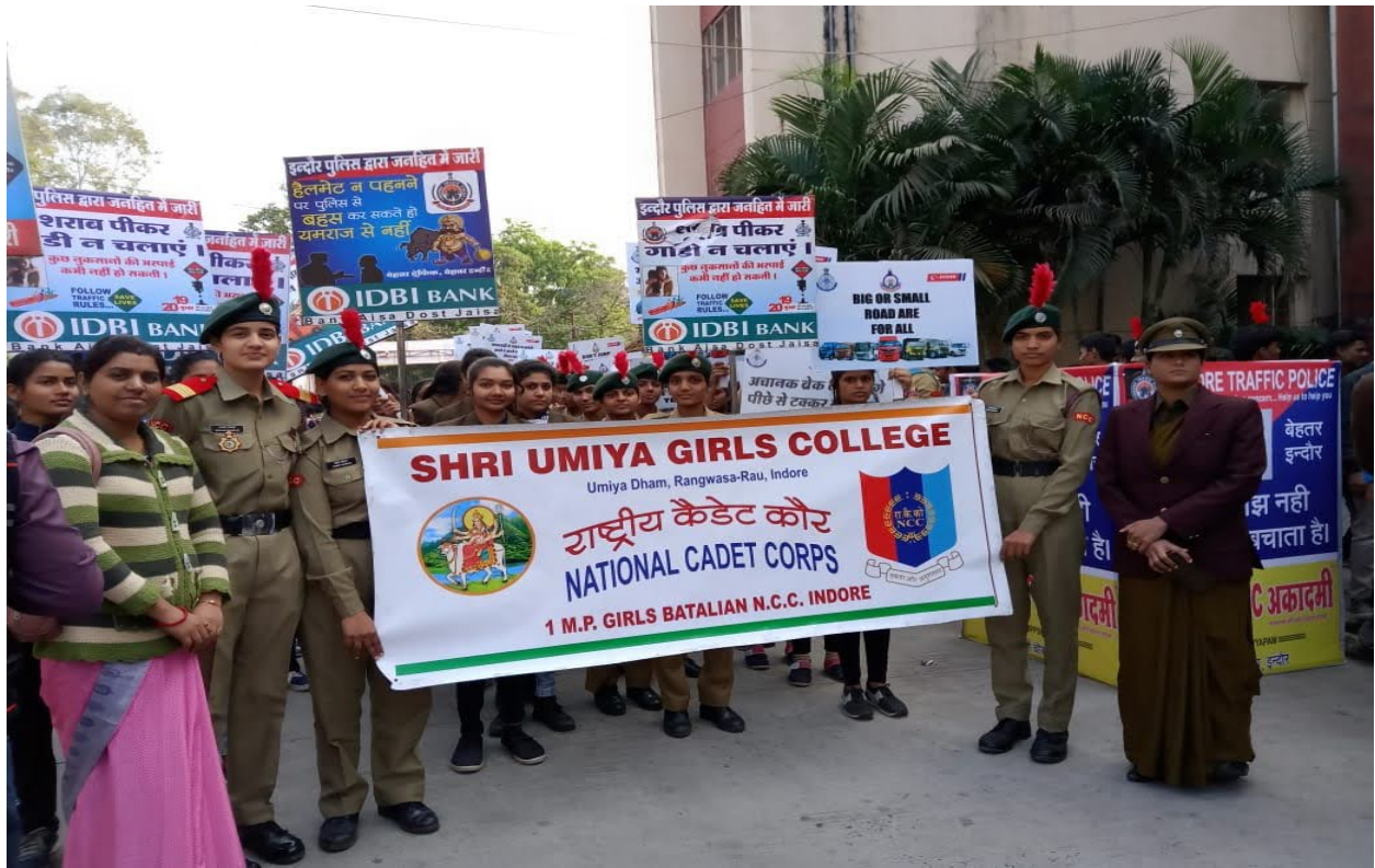
2018-19 #10 TRAFFIC CONTROL REGAL 4-11 february 2019