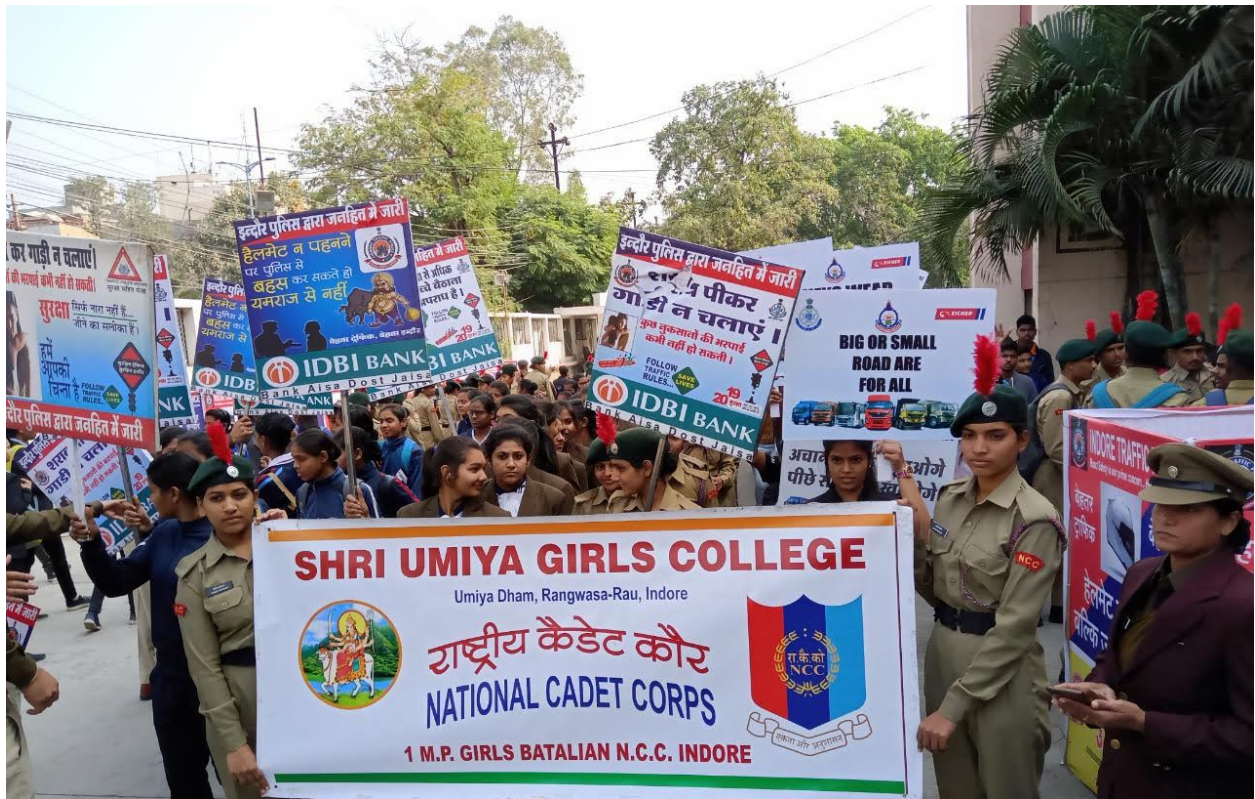
2018-19 #10 TRAFFIC CONTROL REGAL 4-11 february 2019