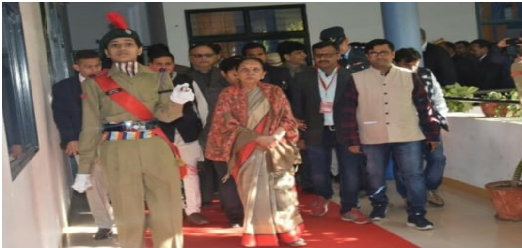
2018-19 #6 VIDHYATHI VIDYA [MODERN SCHOOL] 06 january 2019