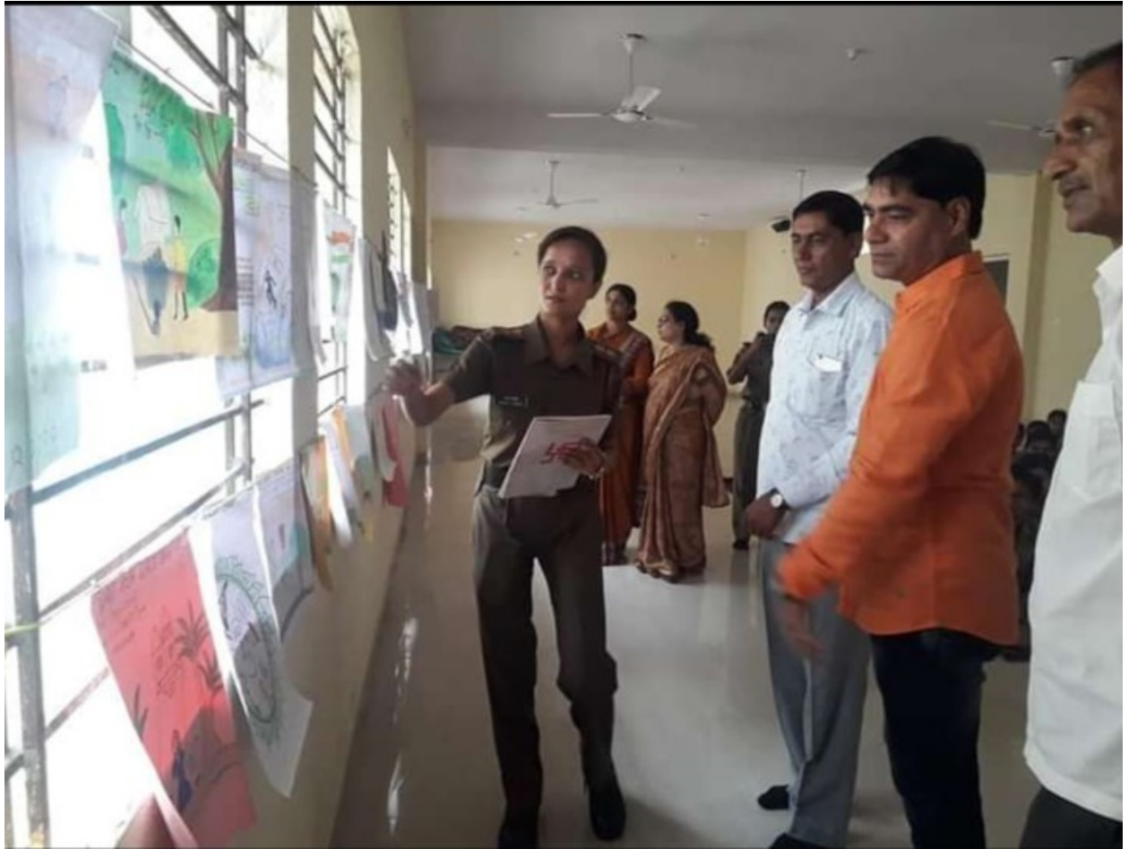
2018-19 #2 SWACHH PAKHWADA 2 October 2018