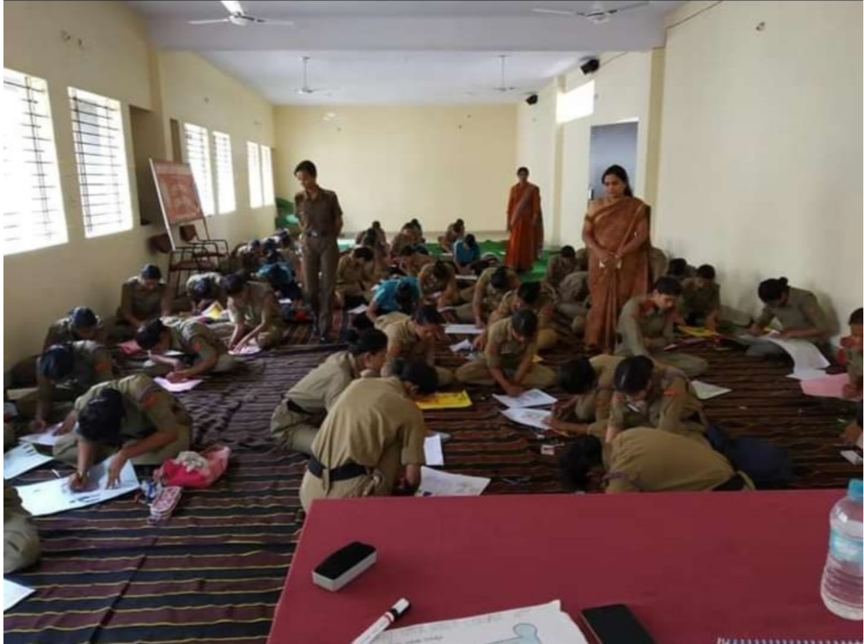
2018-19 #2 SWACHH PAKHWADA 2 October 2018