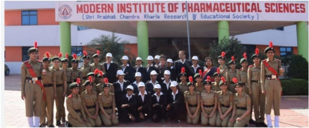
2018-19 #6 VIDHYATHI VIDYA [MODERN SCHOOL] 06 january 2019