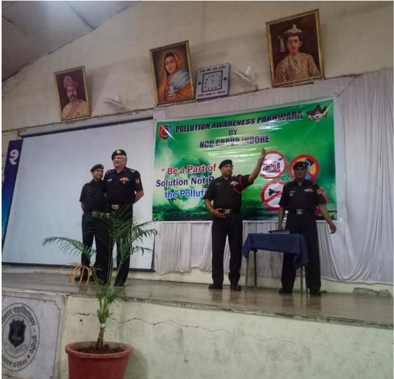
2018-19 #2 SWACHH PAKHWADA 2 October 2018