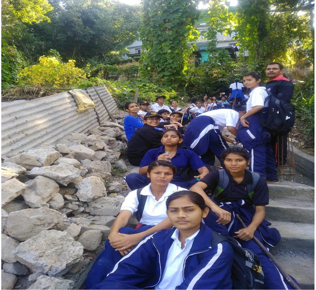
2018-19 #4 TREKKING SIKKIM 22-28 november 2018