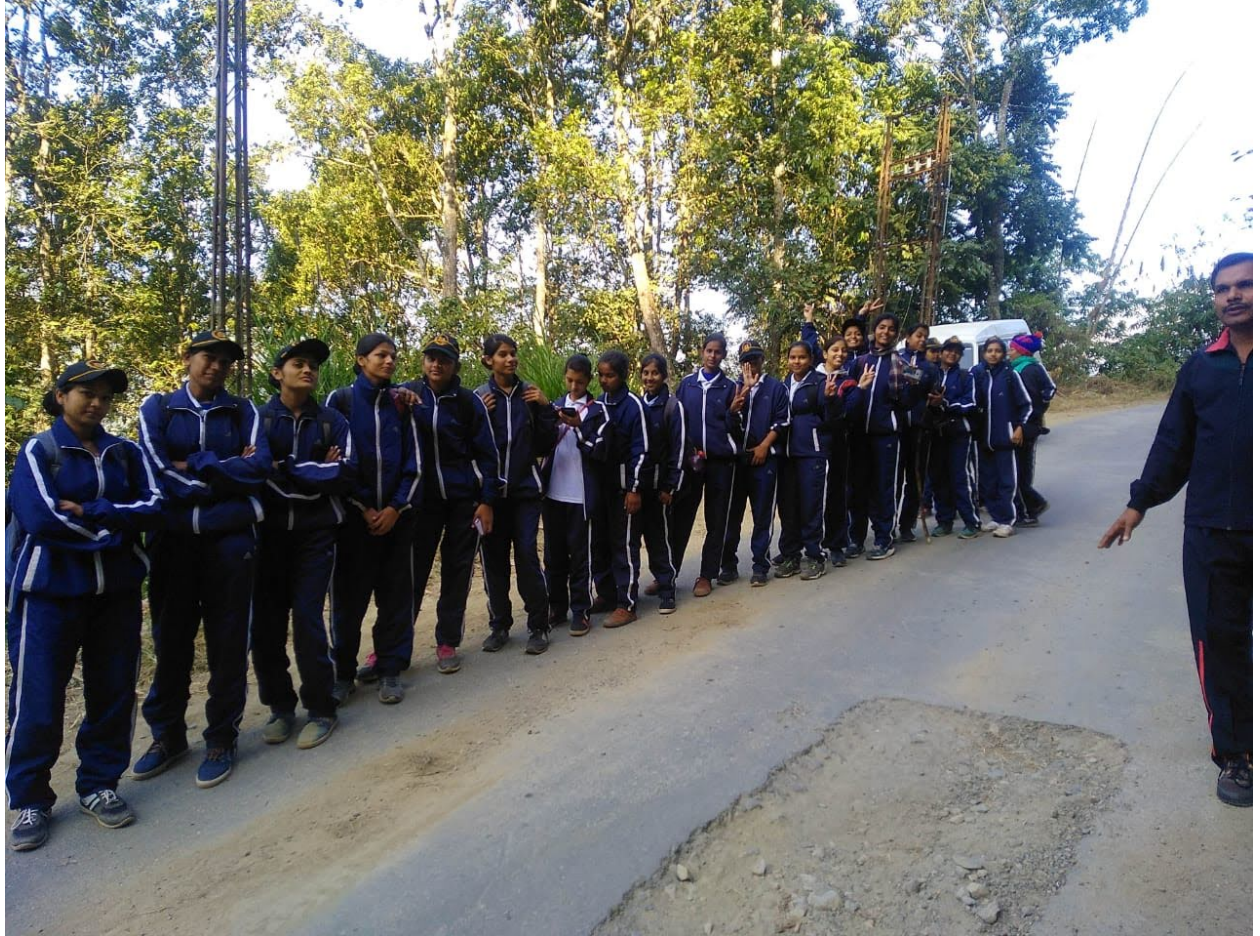
2018-19 #4 TREKKING SIKKIM 22-28 november 2018